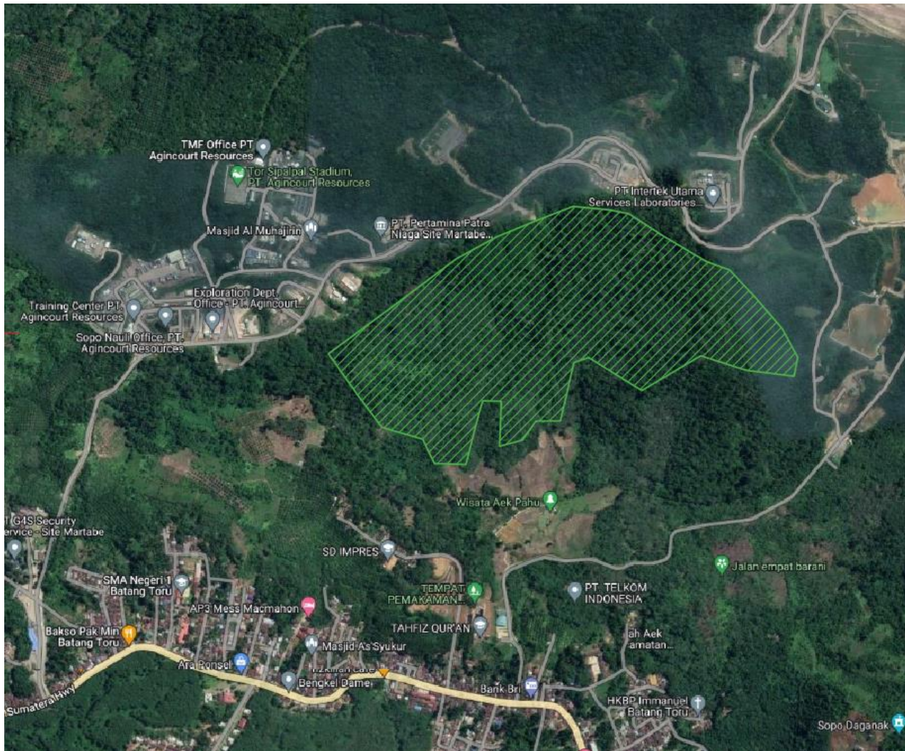
Peta Kawasan Area Konservasi di Google Earth

Jl. Merdeka Barat Km 2,5 Kelurahan Aek Pining Batangtoru, Tapanuli Selatan - Sumatera Utara 22738 T: +62-21 8067 2000 F: +62-634 370 333 www.agincourtresources.com